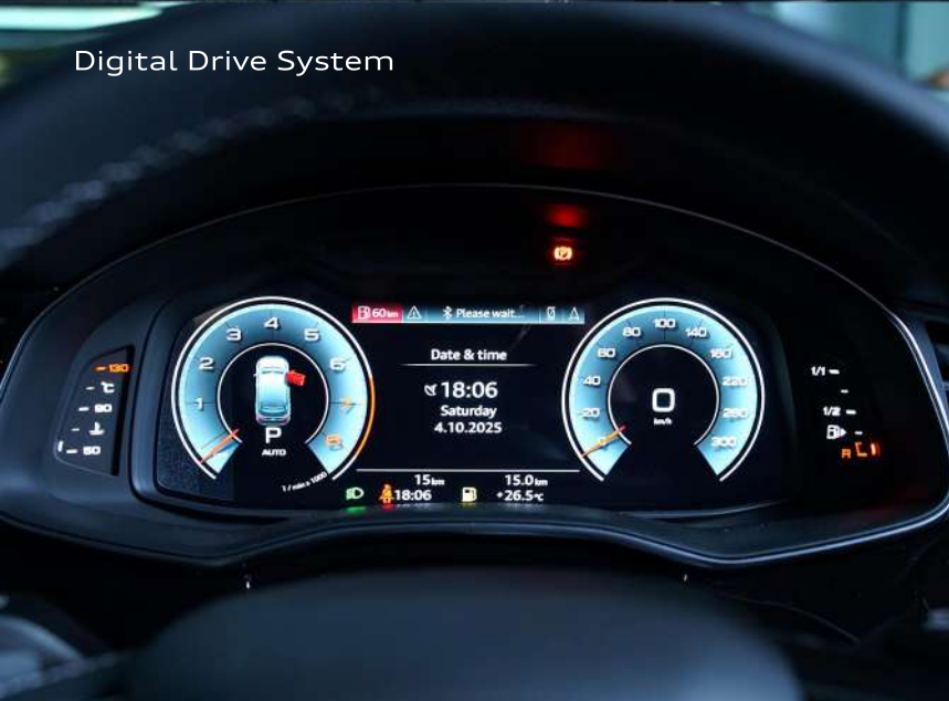
Digital Drive System